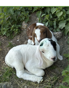
2 of the 7 Kids