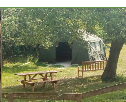
Tent in the Orchard