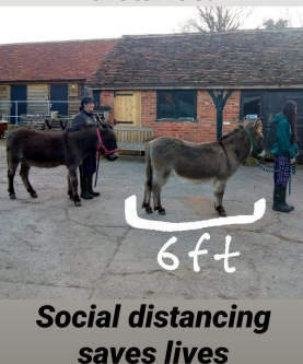
Social distancing donkeys