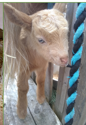
Golden Guernsey billy Kid