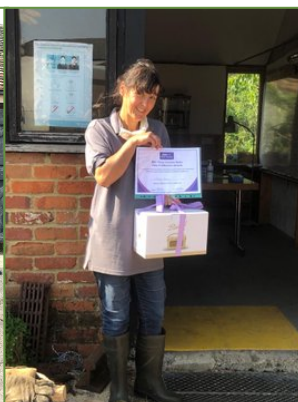
Make a Difference Award win!