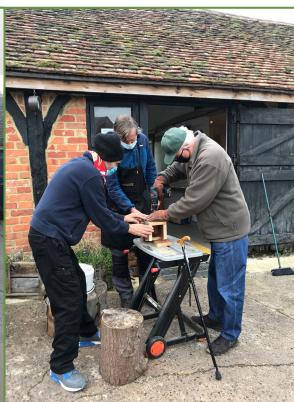
Countrymen building bird box