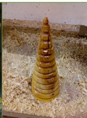
Farm Helper's handywork