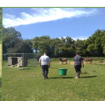
Social distanced care farming