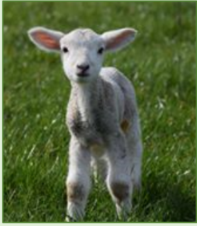
We're still counting the lambs born this spring!