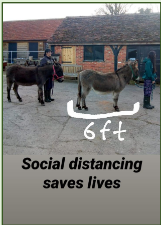
Social distancing saves lives