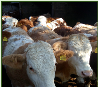
Our herd of Simmental cattle